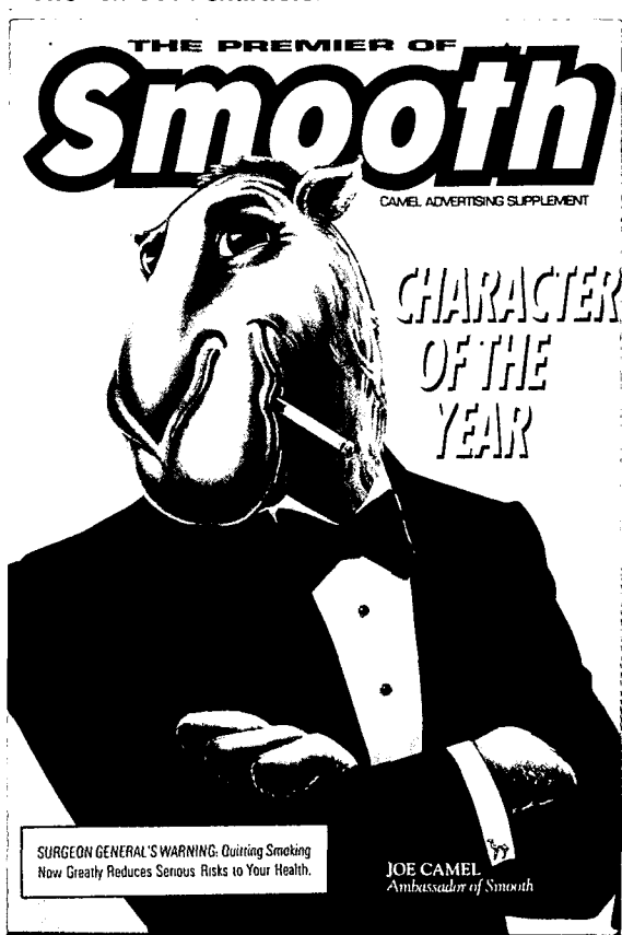
Figure 3 The "smooth character"

Perhaps the most criticized campaign of recent years was the introduction, in 1988, of the "smooth character" cartoon, Joe the Camel (Figure 3). In 1989, RJR Nabisco ran a particularly outrageous four-page ad in youth-oriented Rolling Stone magazine, in which dating advice was offered for young men. On the first page of the ad is a cartoon of a beautiful woman