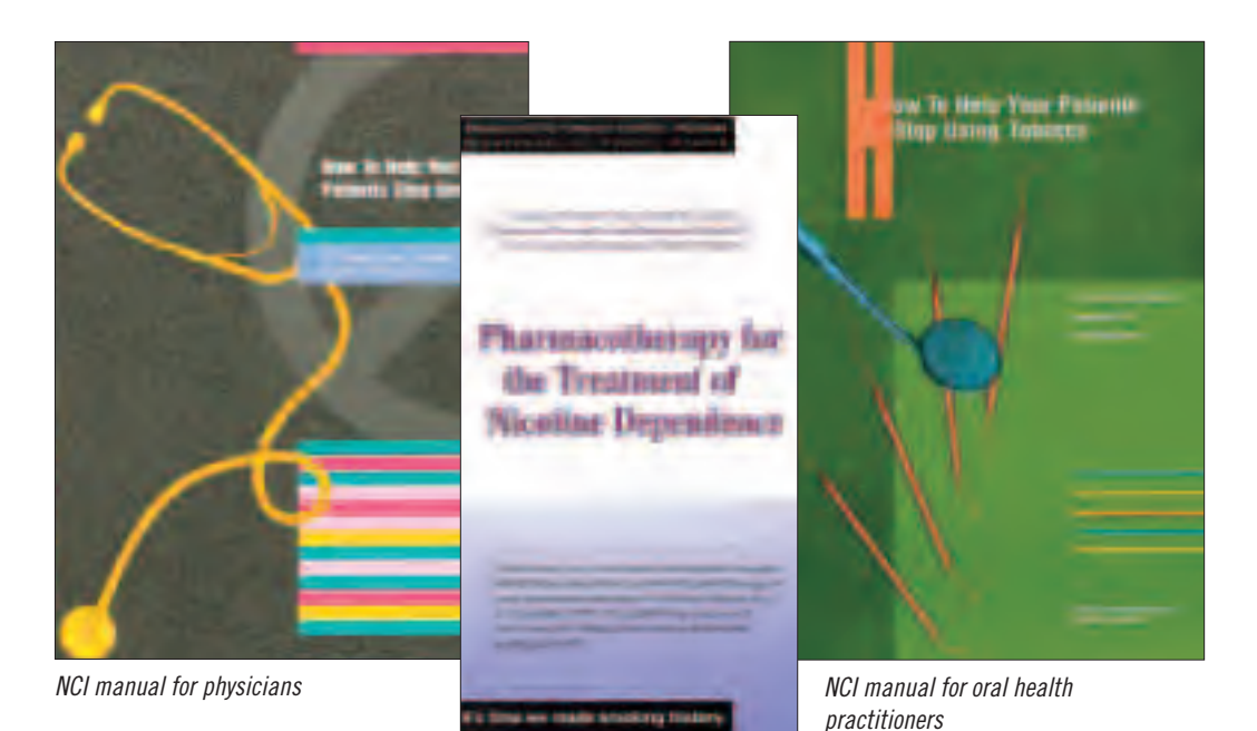
Massachusetts Department of Health brochure

have been reported."20(p1) State ASSIST staff were encouraged to identify and train other health-care practitioners, such as public and occupational health nurses, dental hygienists, and pharmacists to conduct such interventions.<sup>20</sup> The "ASSIST Program Guidelines" also promoted the identification and training of individuals not in health-care roles who could deliver brief interventions supporting smoking cessation. Cessation aids such as print, video, or audio products as well as cessation materials tailored to the needs of a specific priority population (e.g., students) could be used by existing coalitions, organizations, agencies, community groups, and individuals who had access to the education community. This referral to cessation services through a cessation directory is another example of the marketing of