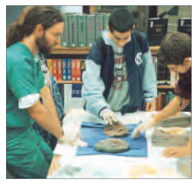
Students participate in a tobacco use prevention activity

By 1998, at least 75 percent of primary medical and dental care providers will routinely advise cessation and provide assistance and followup for all of their tobacco-using patients.<sup>13(p3)</sup>