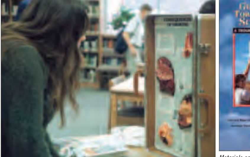
A student studies material on the consequences of smoking

The ASSIST funding itself, $140 million, seemed enormous at that time but would have been quickly depleted if the 17 ASSIST states were unconstrained in their use of the funds to develop and directly provide program services. The indirect approach to providing program services freed ASSIST funds to address